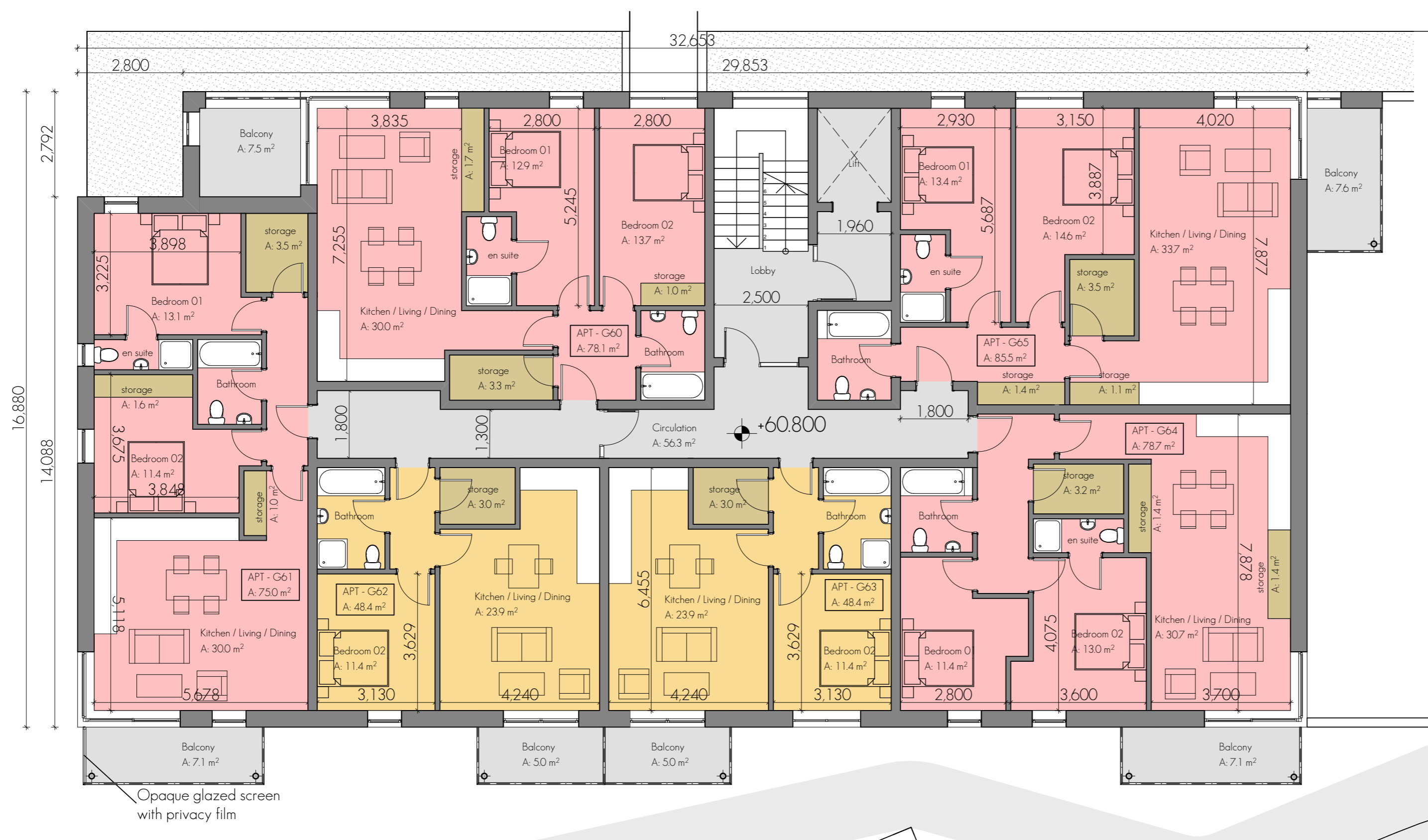
FIRST FLOOR PLAN - BLOCK B THIS IS THE TYPICAL UPPER FLOOR PLAN FOR THE 1ST, 2ND & 3RD FLOOR - FLOOR LEVEL- 1ST_60.800 - 2ND_63.725 - 3RD_66.650 1:100